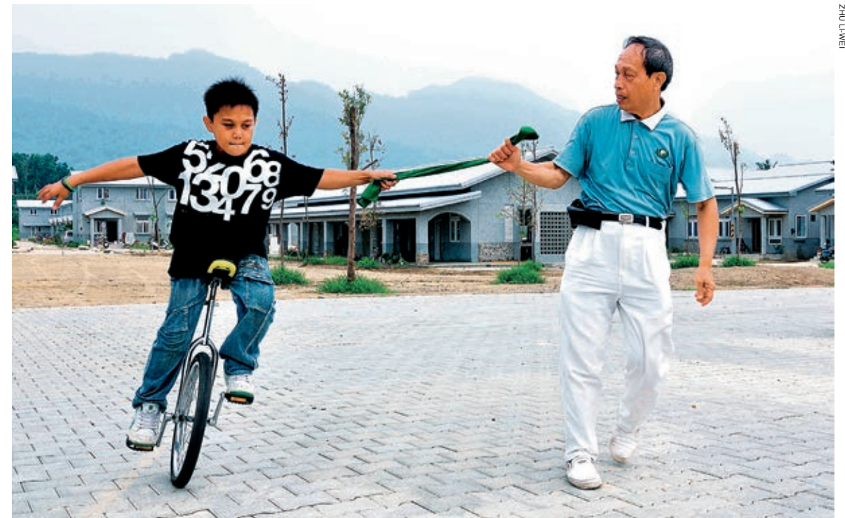
With the help of a Tzu Chi volunteer, a boy learns to ride a unicycle, which helps him to develop a sense of achievement and gain confidence.