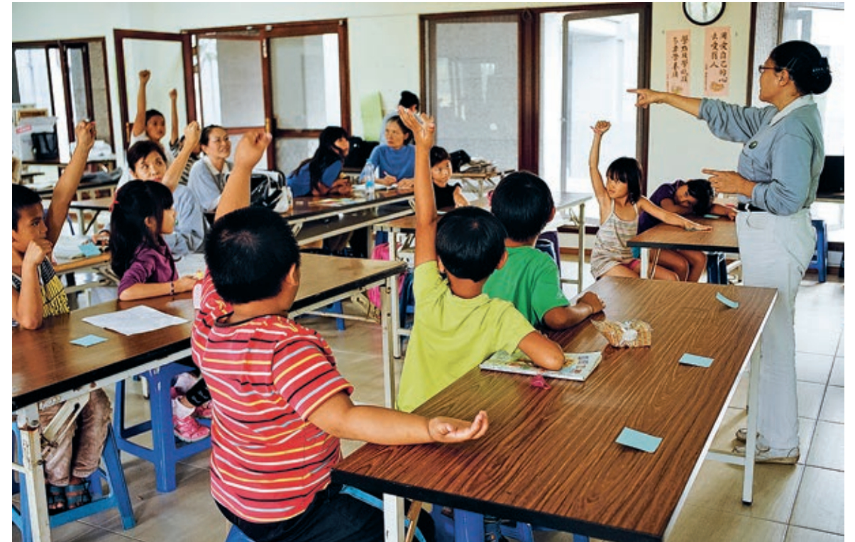
Members of the Tzu Chi Teachers Association teach a Wednesday afternoon class.