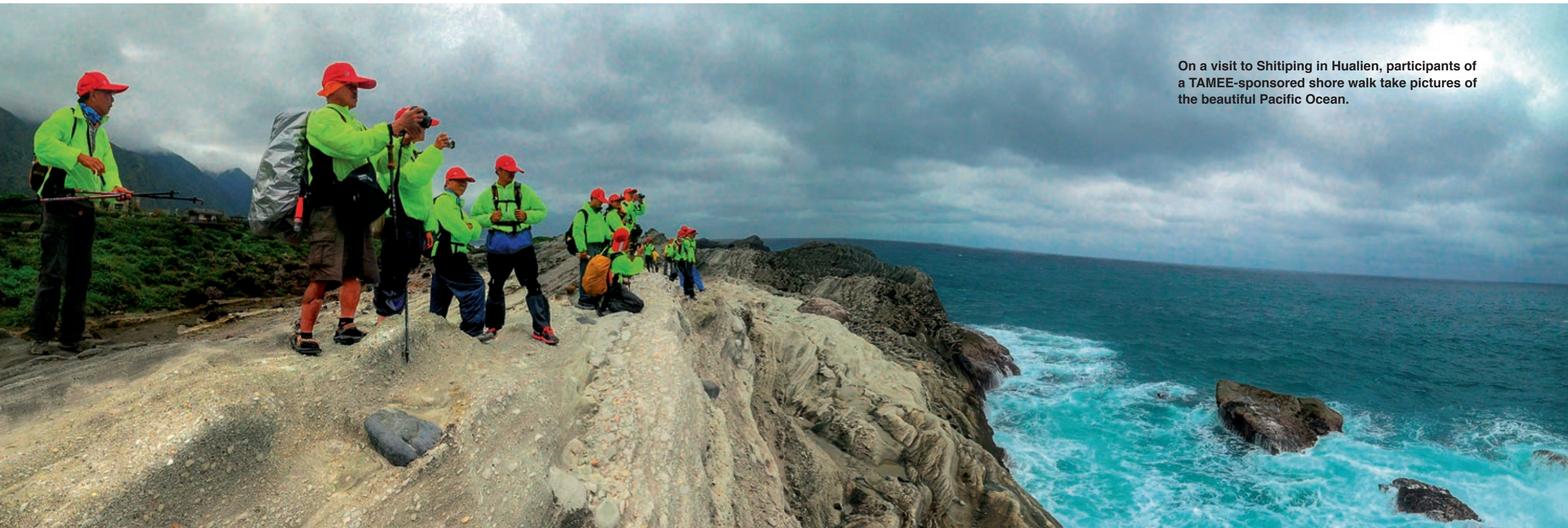
On a visit to Shitiping in Hualien, participants of a TAMEE-sponsored shore walk take pictures of the beautiful Pacific Ocean.

On April 17, 2009, participants of the first public TAMEE tour gathered in front of the rail station in Keelung, a port city near the northern tip of Taiwan. The group of about 50 people, ranging in age from the early 20s to late 60s, was split into two teams. One team set out down the eastern coast of Taiwan, and the other team started on the western coast. Their