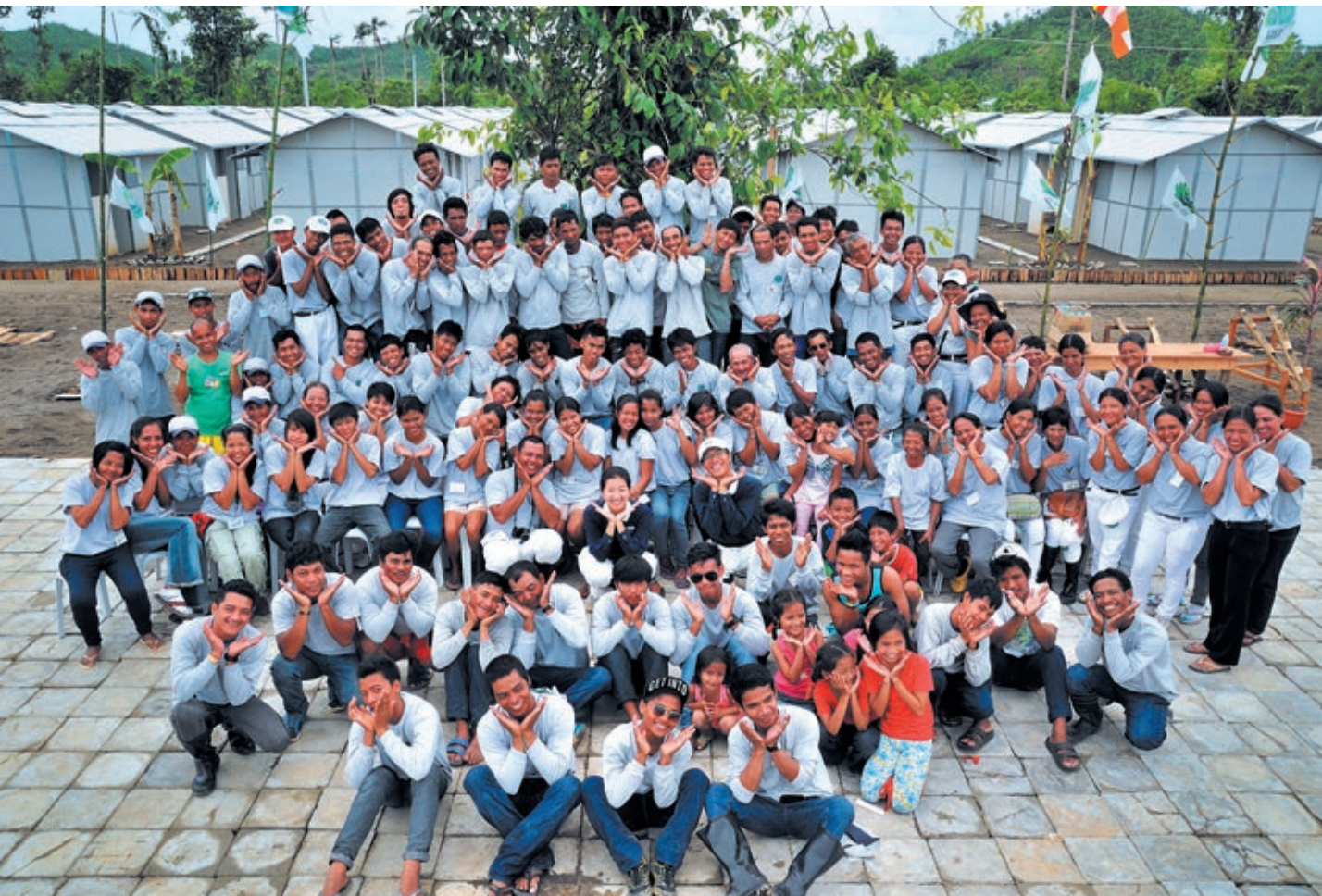
Participants of the cash-for-work program pose for a group picture after the completion of the project.

Now that they all have safe homes, village residents have a solid footing on which to build a better life.