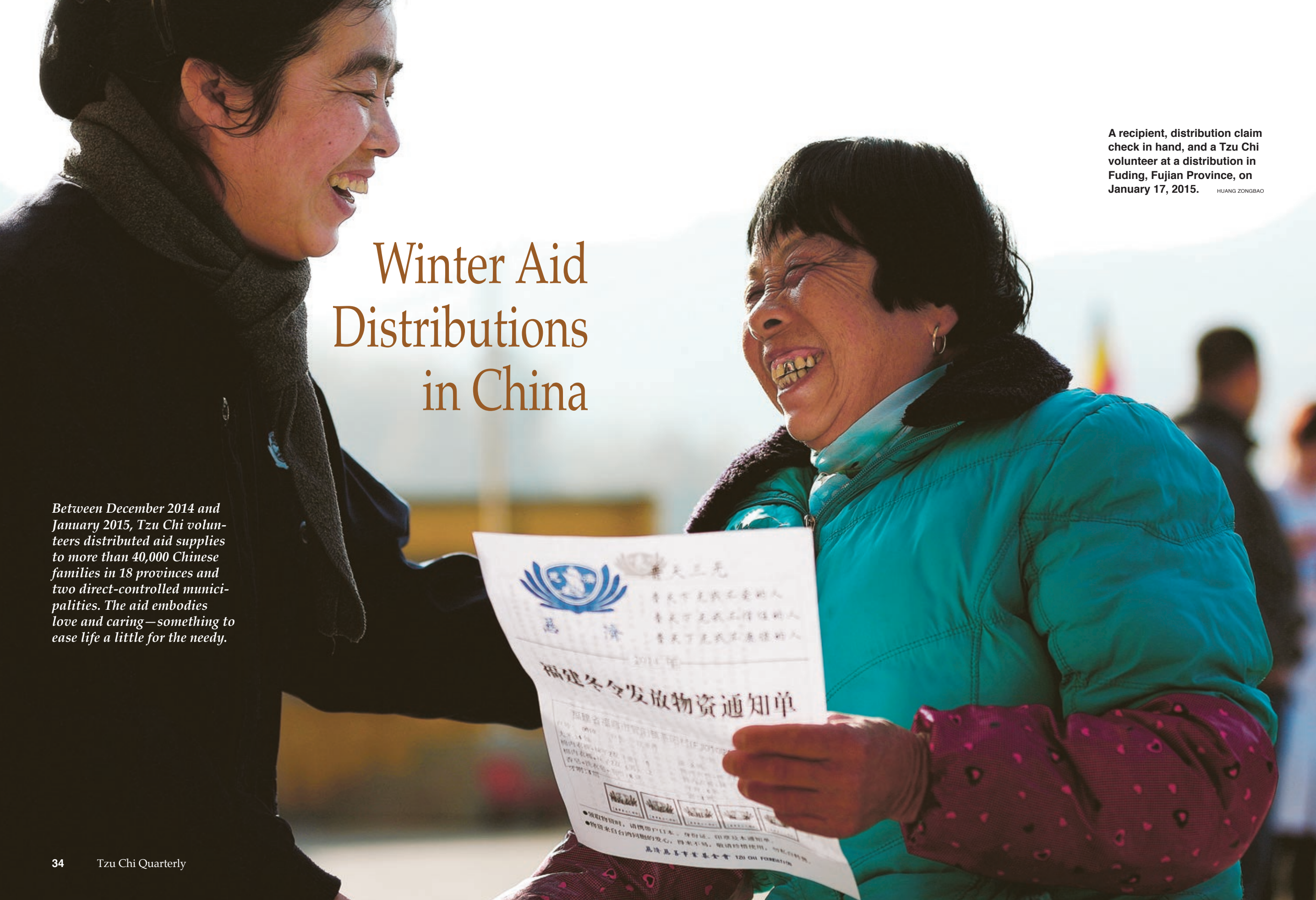
A recipient, distribution claim check in hand, and a Tzu Chi volunteer at a distribution in Fuding, Fujian Province, on January 17, 2015. HUANG ZONGBAO