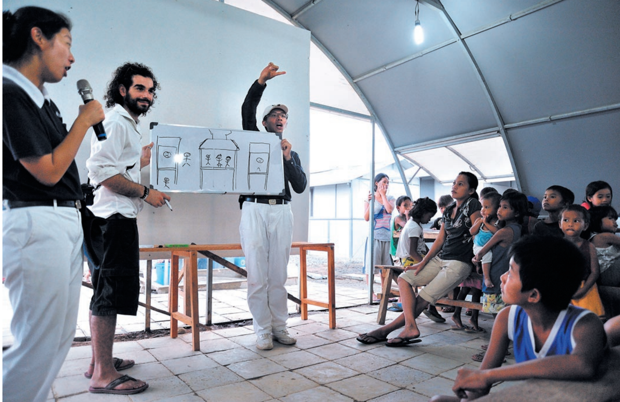
Volunteers from Tzu Chi and another NGO solicit input from children about the design of the village playground.

about pooling resources and collaborating for the benefit of the villagers.