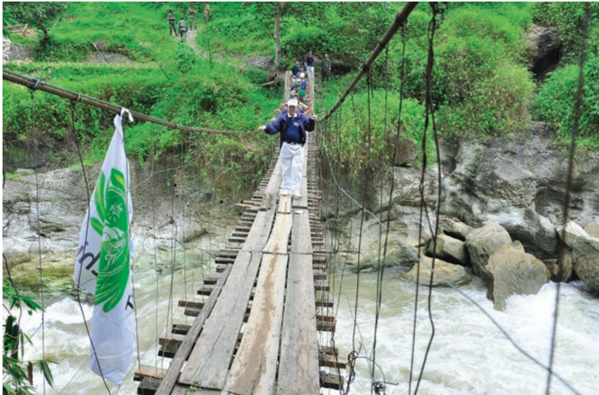
Representatives from Tzu Chi, the military, and Yayasan Dana Sosial Priangan walk on this rickety suspension bridge to experience the fear that residents feel when walking on this bridge every day.

Most students at the school come from low-income families. The teacher said the books donated by Tzu Chi encourage students to read and learn new knowledge and to develop good reading habits. The library has become a place that the students like to visit.