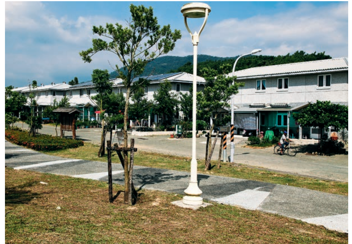
A corner of Shanlin Great Love Village