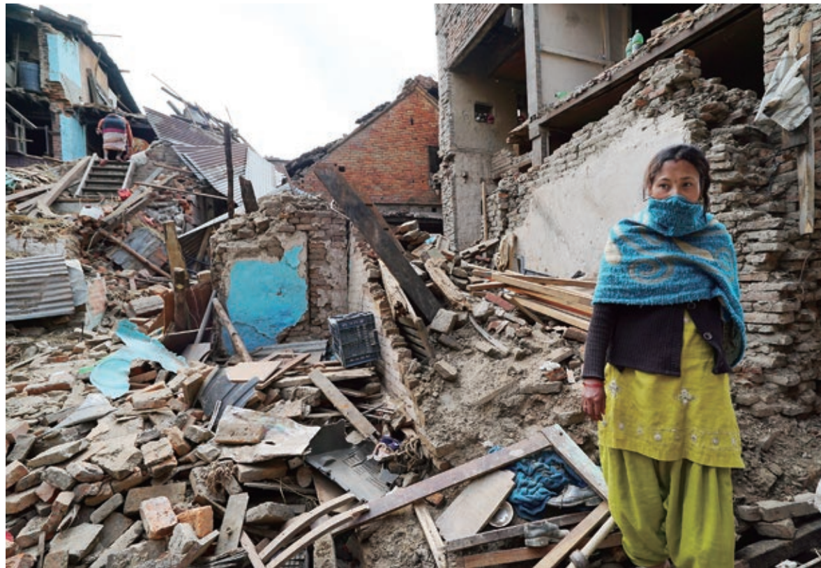
A 7.8-magnitude earthquake rocked Nepal on April 25. Tzu Chi has been providing aid to the country since the disaster.