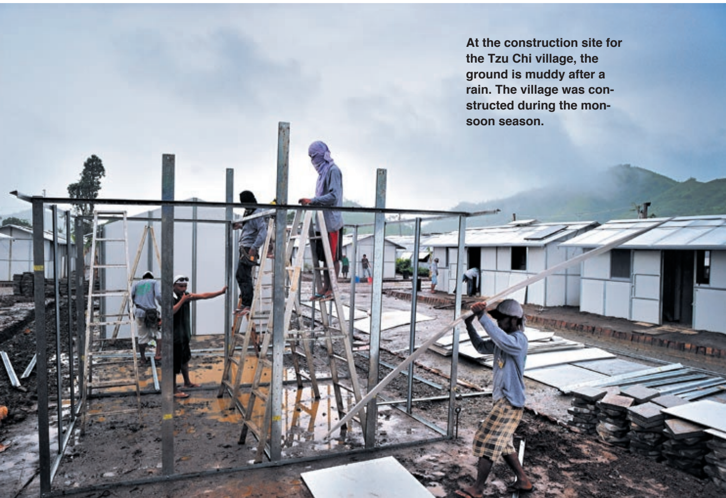
At the construction site for the Tzu Chi village, the ground is muddy after a rain. The village was constructed during the monsoon season.

110 square feet in size, were built one next to another, separated only by plywood. Bathrooms and kitchens were shared by the residents.