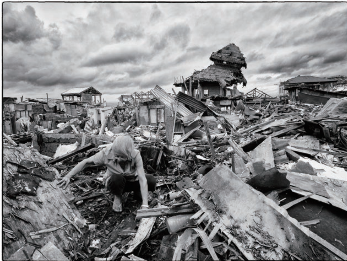
Tacloban, the Philippines, January 15, 2014

A woman in her seventies was looking and digging for something where her home once stood, on the shoreline in Tacloban, Leyte Province, the Philippines. Her home had stood there for more than seven decades when Typhoon Haiyan destroyed it on November 8, 2013. When the winds and the rains had died down, many of her long-time neighbors had also died, without saying goodbye. They had beaten her in leaving this turbulent world. She had always lived alone, but now she was even more solitary.